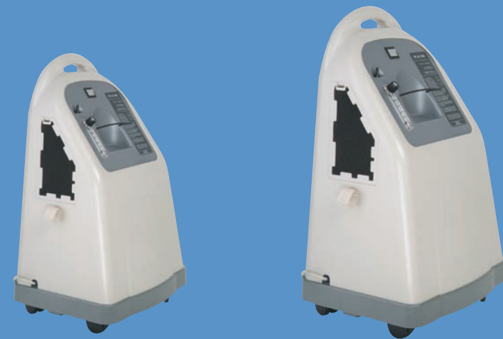
AXS590 Oxygen Concentrator, 5L