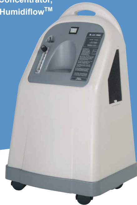
AXS590Hi Oxygen Concentrator, 5L, OCI, Humidiflow™