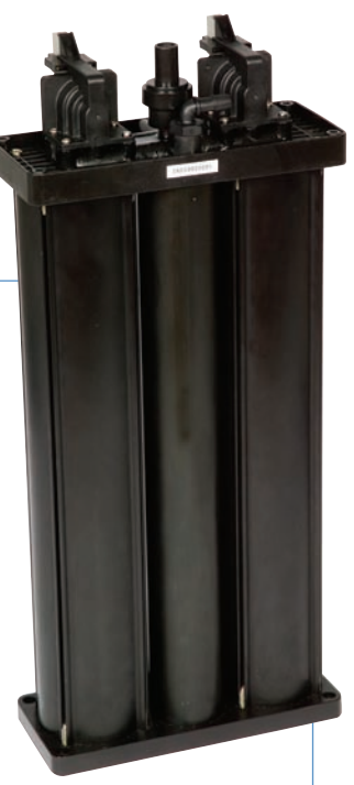
AXS 590 Series