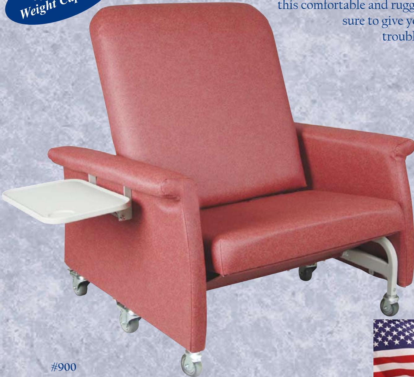
#900 Bariatric Chair