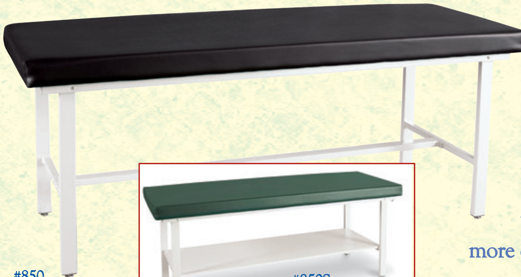
#850 Treatment Table

No other manufacturer builds a more durable table or offers the standard features Winco does.