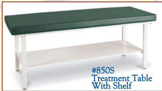
#850S Treatment Table With Shelf