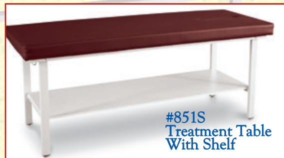
#851S Treatment Table With Shelf