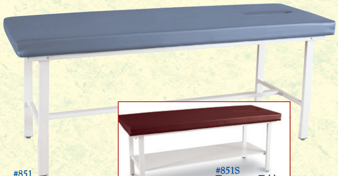
#851 Treatment Table Face Cutout